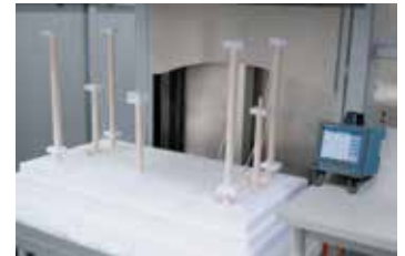
Measurement set-up in a high-temperature furnace