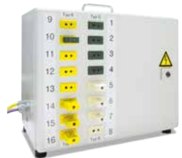
TUS module with ports for 16 thermocouples and PROFIBUS connection to the Nabertherm Control Center

The TUS module has its own PLC which converts the measurement results of the testing thermocouples. The evaluation, including an easy-to-navigate and simply log function, is then performed via the furnace's Nabertherm Control Center.