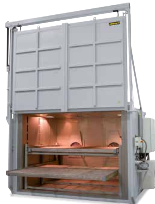
N 12012/26 HAS1 according to AMS 2750 E

As an alternative to instrumentation with the Nabertherm Control Center (NCC) and PLC controls, instrumentation with controllers and temperature recorders is also available. The temperature recorder has a log function that must be configured manually. The data can be saved to a USB stick and be evaluated, formatted, and printed on a separate PC. Besides the temperature recorder, which is integrated into the standard instrumentation, a separate recorder for the TUS measurements is needed (see page 64).