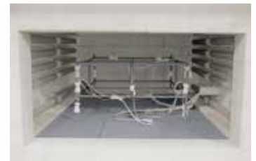
Measurement set-up in an annealing furnace